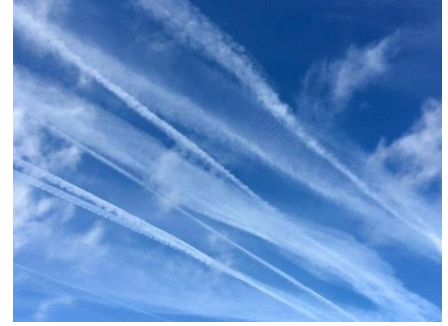
What partly cloudy used to look like